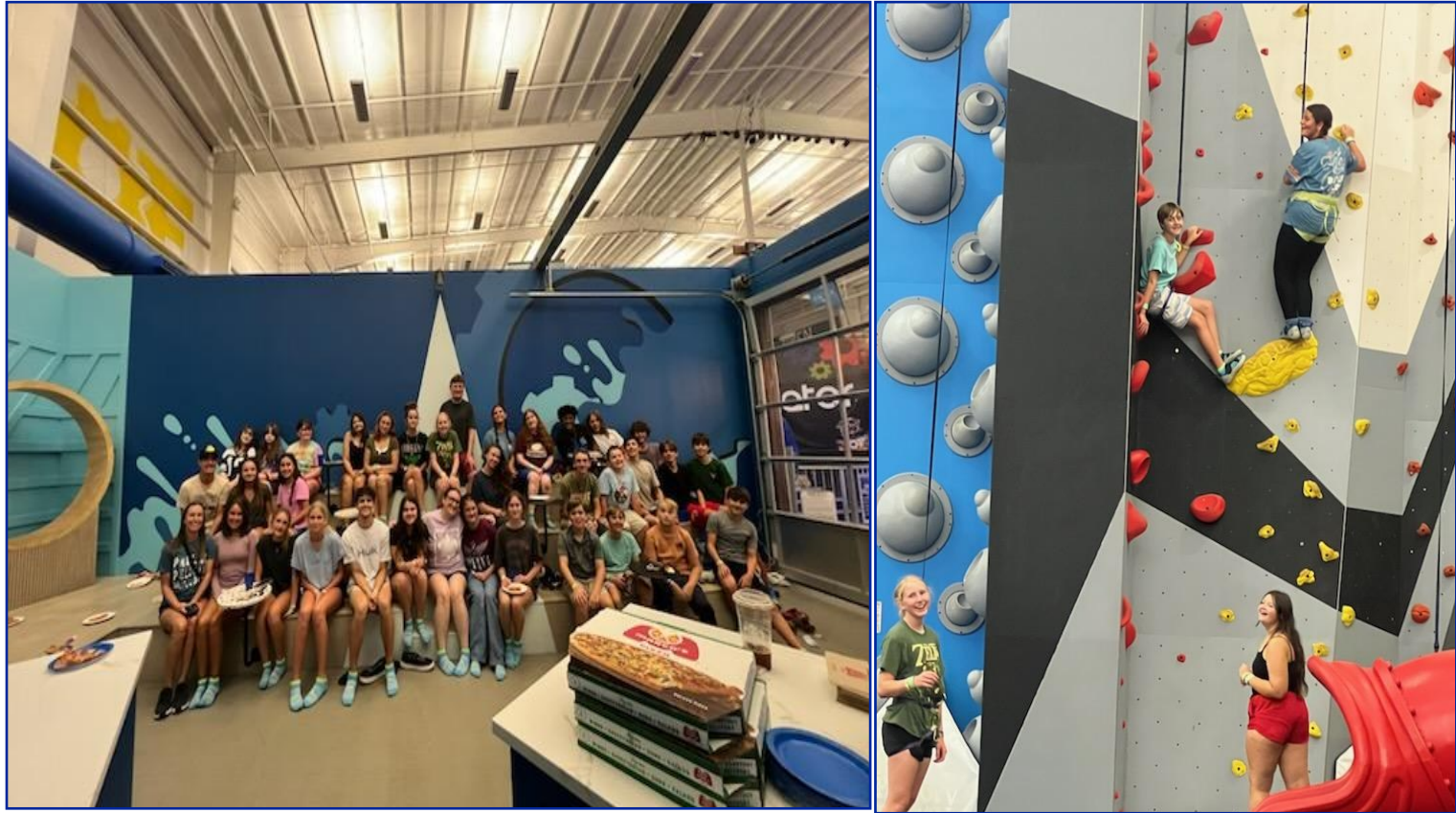
A couple of pictures from Refuge Youth’s Back To School Bash at The Factory in Gulf Shores. 34 in attendance—Awesome!